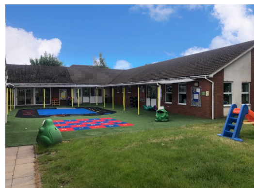
Early Years playground