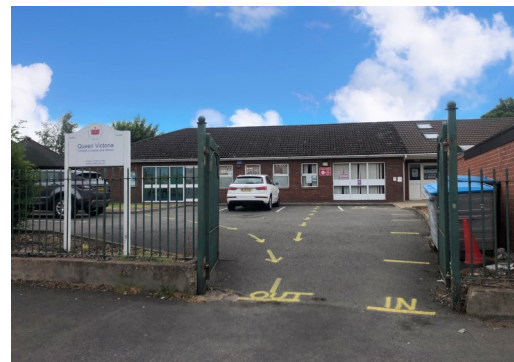
Entrance from School Street